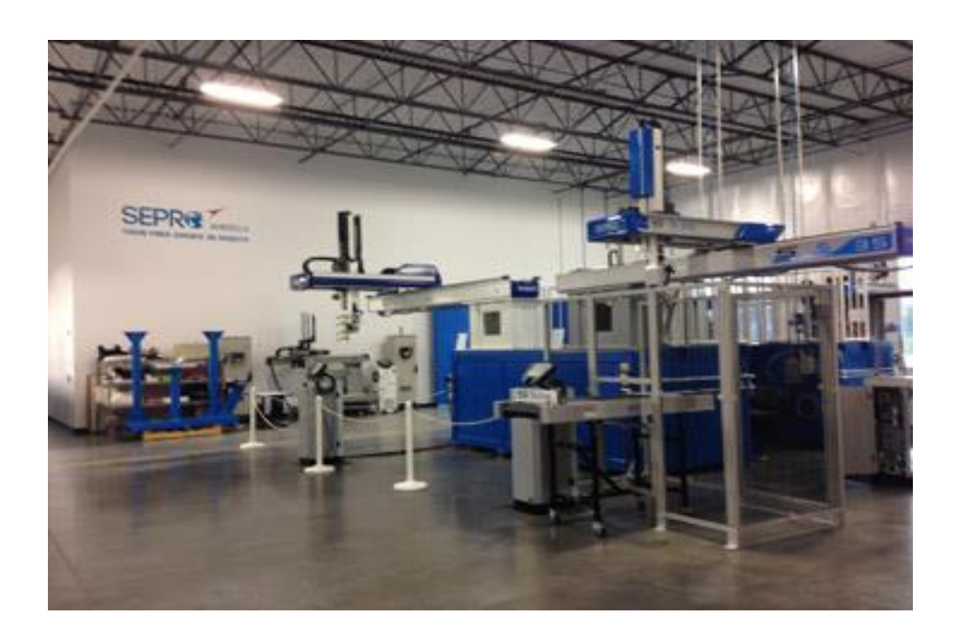
Sepro America plans to expand its facility in Warrendale, PA (Pittsburgh) and begin assembling robots in in Q4 of 2017. Download a high-resolution image at: <a href="http://tinyurl.com/jh6v5tc">http://tinyurl.com/jh6v5tc</a>