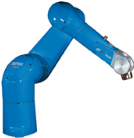
A Sepro 6X-90L 6-axis articulated-arm robot (left) and a Sepro Success 11 Cartesian beam robot with telescoping arm (above) can be seen in a live demonstration of insert loading and part removal at Plastec West 2019. The demo illustrates capabilities like insert pick-up and placement, part removal and accurate positioning for post-mold operations.